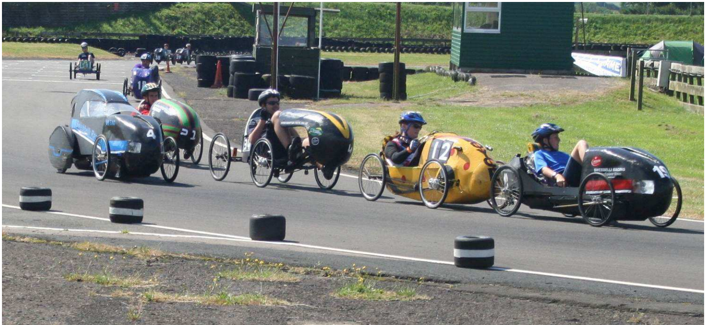
There is a wide variety in styles of car.

Stratford and Runway Straights test the cars' straight-line speeds whereas the Bruno Chicane complex is waiting to catch out anyone whose handling is perhaps not all that it might be (particularly in the wet). It is a track which certainly keeps the drivers awake whilst allowing plenty of width for lapping back markers.