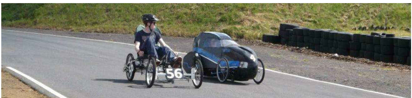
Teams of all different ages and abilities race together on the same circuit at the same time. Negotiating slower cars is something the fast teams simply have to get good at!