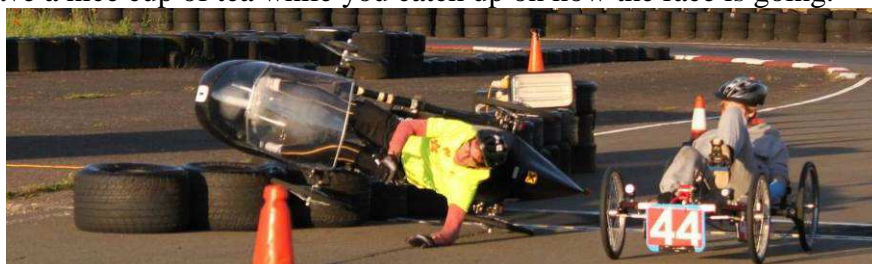
Sometimes, things do not always go entirely to plan...

This is the main place where you can check the timing and scoring screen as well so why not drop in, take a well earned break, and have a nice cup of tea while you catch up on how the race is going.